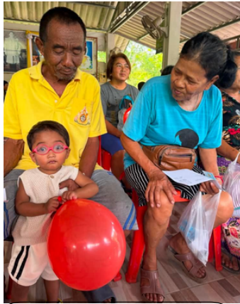
Local villagers waiting to be seen