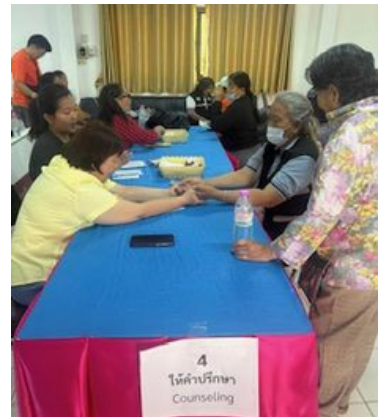
Counselors praying for new believers.