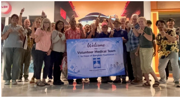
Welcoming Team @ Hope Church, Hatyai, Songlka