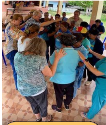
Praying for local leaders