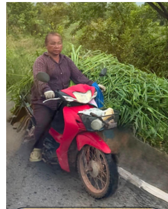
Local villager arriving to receive medical servicest